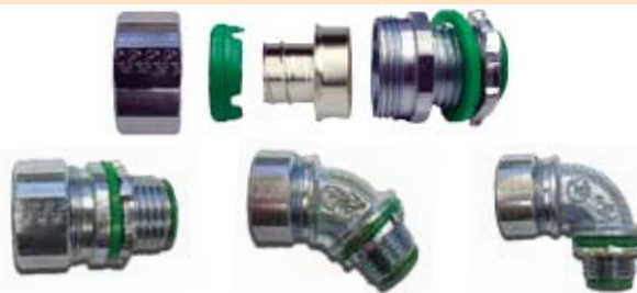
NPT Thread 3/8" through 6"